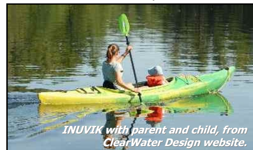
INUVIK with parent and child, from ClearWater Design website.